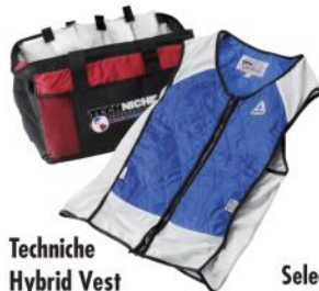
Techniche Hybrid Vest