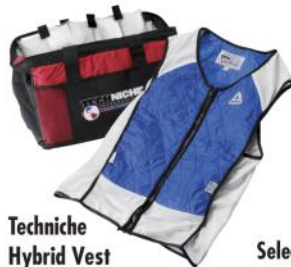
Techniche Hybrid Vest