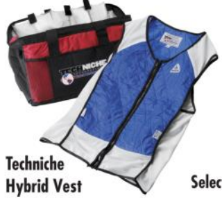
Techniche Hybrid Vest

Complete vest and phase change packets only $199.99 . In stock and ready to keep you cool. Officials, Turn Marshals and Crews — You have not been forgotten. Try the Techniche Evaporative Cooling Towels. Just soak in water and you'll stay cool for hours. Only $10.95