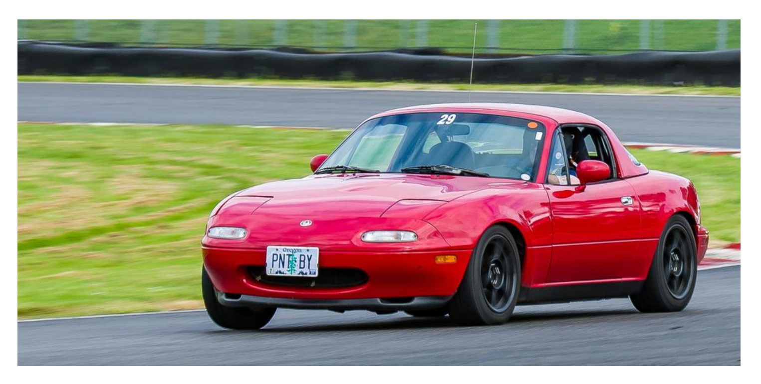
1995 NA Mazda Miata – HPDE, Auto Cross, Time Trial Car – Turn Key! 163k miles on Chassis / 45k miles on motor