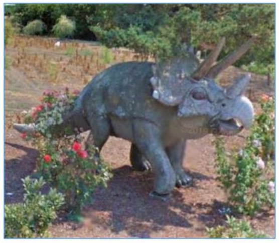
Triceratops on Kansas City Road

We enjoyed writing this rally. We used many of our favorite rally roads, roads we like to drive even when we're not on a rally. Our goal was to present a typical Cascade Geargrinders Saturday Series rally, including most things you'd expect to encounter. It was a teaching rally. And it seems it was successful.