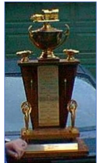
Have you seen the Oregon Trailblazer trophy? If you find it, please contact rally@cascadesportscarclub.org

Fourteen (14) teams pre-purchased rally entries with a seven-event Series Pass (four teams) or a nine-event Season Ticket (ten teams). These pre-paid entries ensured a steady number of entries at each rally. What we saw in 2022 was a downturn in the number of new first-timer rally teams.