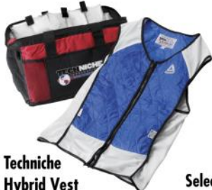
Techniche Hybrid Vest