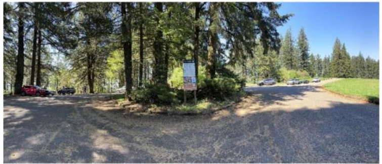
Entrance to Bald Peak Scenic Viewpoint