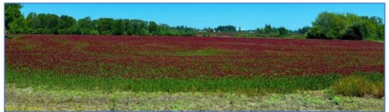
Crimson Clover, just starting to bloom