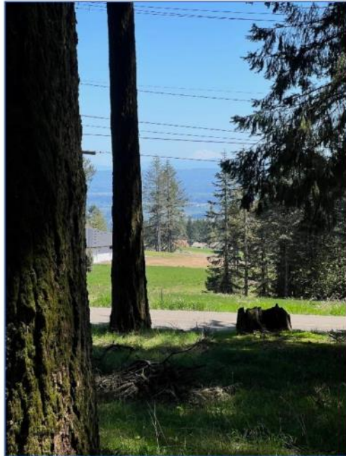
From Bald Peak looking east at Mt. Hood