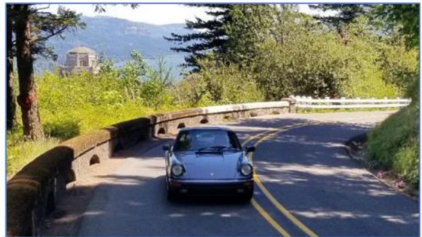
Car #20 leaving Crown Point