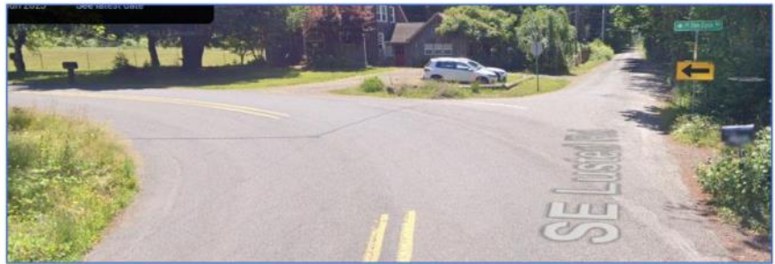
Lusted Road goes straight

We saw only a couple teams follow the on course route straight on Lusted. An OR instruction offered a two-minute pause to the off course teams since the on course route was longer. Leg 7 scores reflect how this challenge worked out.