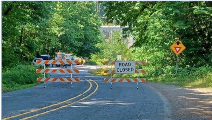
Bull Run Bridge closed on rally course measurement day

There was one more ONTO challenge, one protection, and two left at T challenges. Yes, L at T is still a challenge.