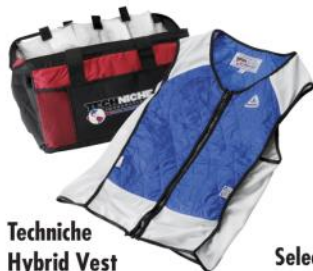
Techniche Hybrid Vest