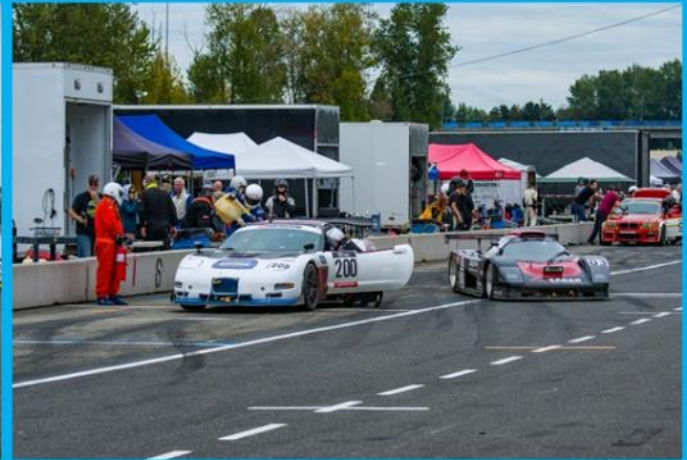
Live Pit Stops