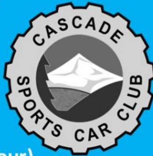
8pm Nighttime finish (8 Hour)