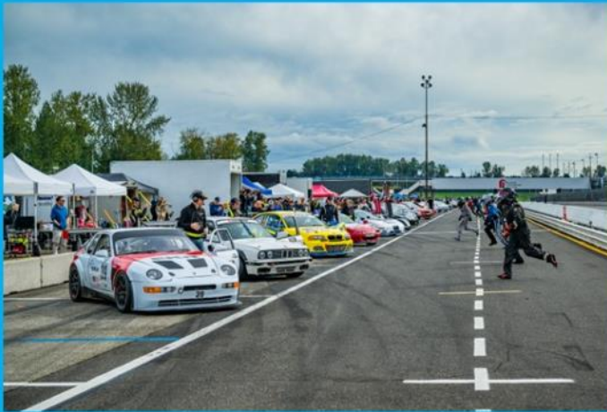
12pm Le Mans Start