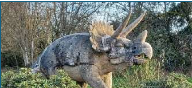
Rallymasters Victoria Saager and Kathryn Iverson's Rally School Rally is titled the Cretaceous Campaign, honoring the Rallymasters' obsession with this large roadside landscape statue. You can be sure it is referenced in the Rally School Rally.

Cascade Sports Car Club's Road Rally program (aka Cascade Geargrinders) offers beginner-friendly time-speed-distance road rallies, lasting three to four hours, starting and ending in the Portland area.