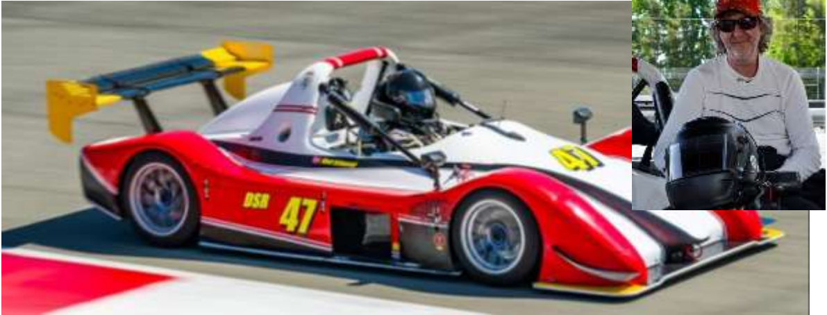
Report from Team Norsk Racing

I added new content to my increasingly vast supply of bloopers during the season-ending enduro at PIR. We failed to complete the full 4hrs we were competing in due to contact with the wall, but we still had great fun in the variable conditions. Racing open cockpit in the rain? No problem – just adds to the experience! I'm happy to report that the guest driver in my car suffered no injury during the mishap (moment before impact in picture), and my hope is that this is not by chance, but by design.